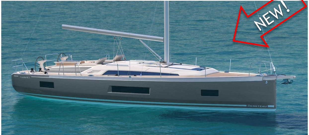
Non contractual image. Illustrations may feature optional equipment available at additional cost.

Commissioning - Delivery & Registration included